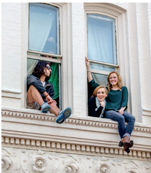
CLOCKWISE FROM OPPOSITE PAGE: Incorporate exercise into your city tour. The wine cellar at McCrady's has a large selection. Friendly residents are always willing to visit.

Charleston who have known each other for generations. There is accountability in that situation. When you know everybody, you can't get away with anything."